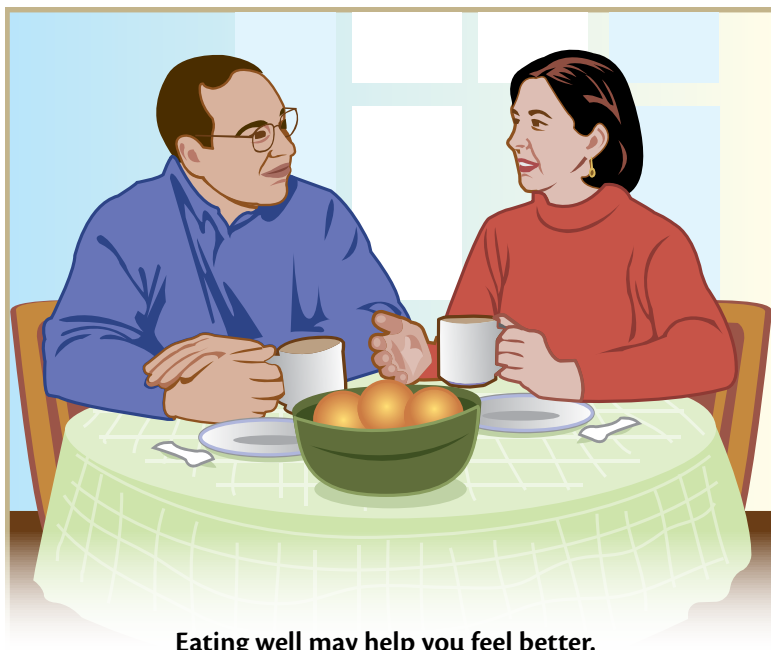
Eating well may help you feel better.

Your doctor, a registered dietitian, or another health care provider can suggest ways to help you meet your nutrition needs. Also, the NCI booklet Eating Hints has many useful ideas and recipes.